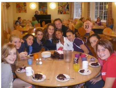
In House dining

One of the unique features of Repton is the in-House dining offered by each of the Houses in the school. Each house has its own chef and support staff, and will run the dining room in a unique way: