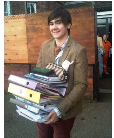
Above: An U6th Sale of Work slave Below: Mario & Luigi or the L6th?

Success might not have come our way this term in the minor sports but never has Latham struggled to find boys willing to pull on their blue and white top in order to give their very best for the House. Long may this spirit last!