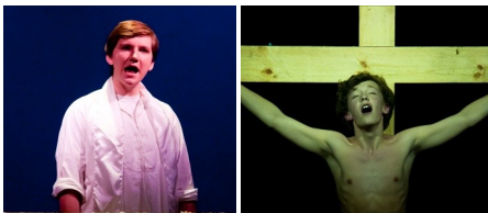
Above: The Mysteries - God and Jesus Below: The 'Latham Four'