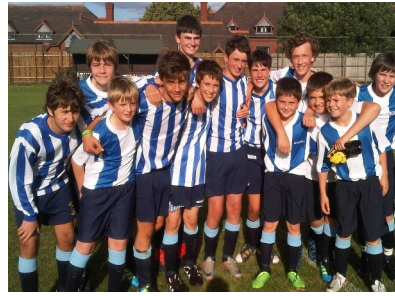
Above: the junior football team Below: the league-topping seniors