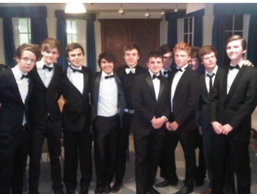
Above - U6th before Xmas Social Below - The Junior Ice-breaker Bottom - Wear What You Dare Day

Going into the swimming gala, the boys therefore knew that they would have to put in a very special effort to overhaul the boys in red and white. This we did, with a number of boys winning or coming second in their races. The seniors won their trophy but it was another agonising second place as Latham finished on 138 points, with Orchard on 150. We may have lost the silverware, but it was another fantastic House effort.