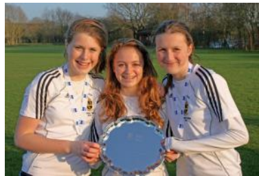
National Under 14 Hockey Players

The whole night was really good and I really enjoyed the films.