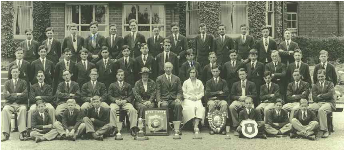
16 han – Latham House 1937