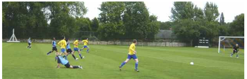
ORFC 1st XI

Fantastic performances against the school in September – 4 victories, with a particular highlight being ORFC 1st XI beating last year's ISFA Cup finalists 3-0 – pay testament to this, and the team can only get stronger as players gel and systems fall into place.