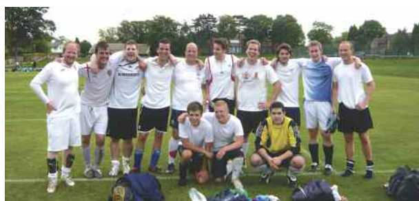
ORFC 3rd XI

Outside of the cup, last season was full of the ORFC's characteristic thrills and spills, with an opening day 5-1 victory over Radley a highlight, along with two fixtures against Malvern which yielded a combined total of 16 goals.