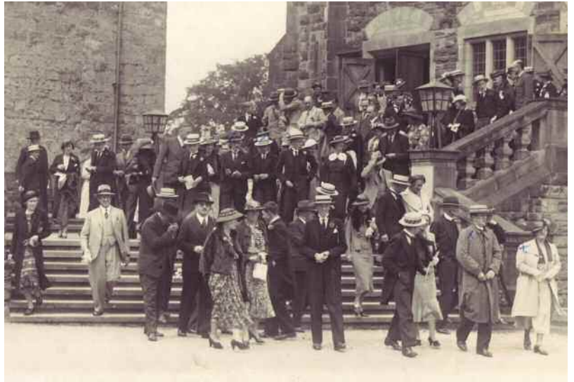
Repton Speech Day June 25th 1937